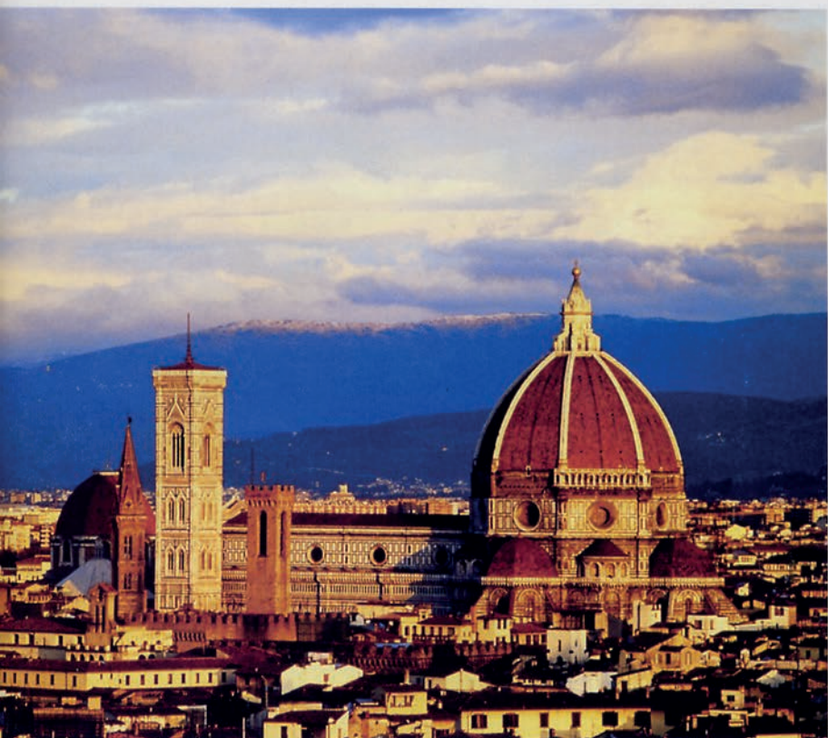
The Duomo dominates the Florence skyline and is within a stone's throw of the student accommodation. Although the walk to the top is tortuous, it helps to work off the pasta

late night at the Corner Pub and Blue Bar.